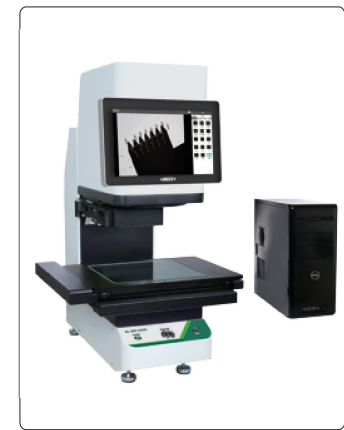
11.6" LCD (optional)